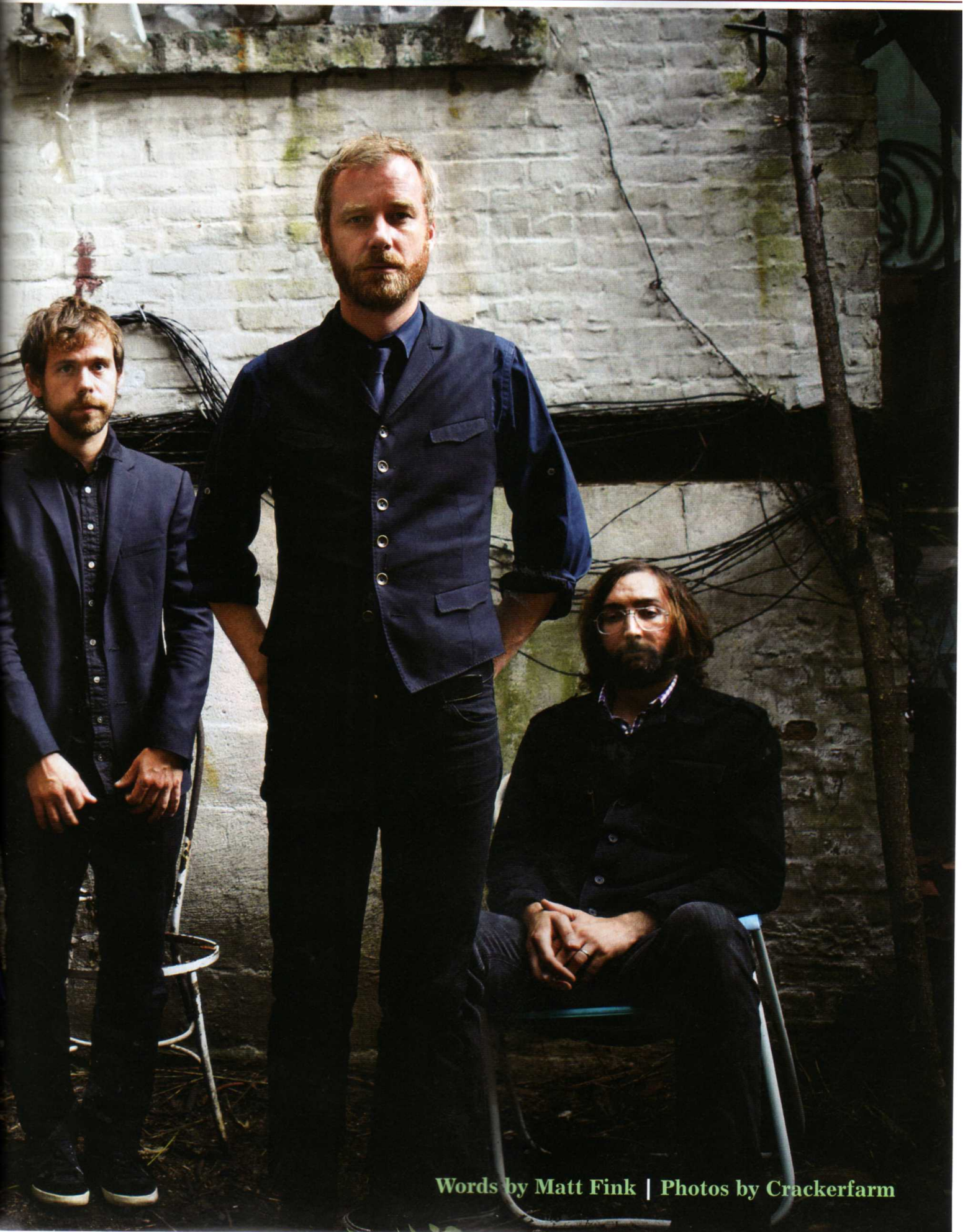
Words by Matt Fink